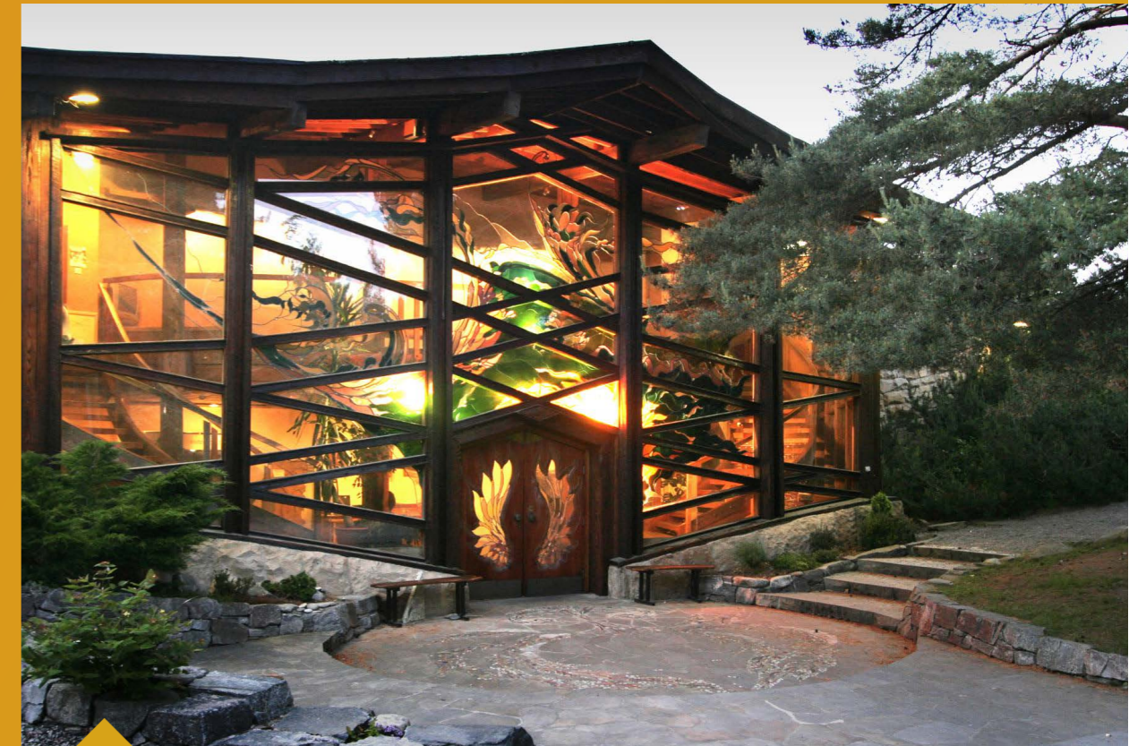
Universal Hall at Findhorn where the event will be held